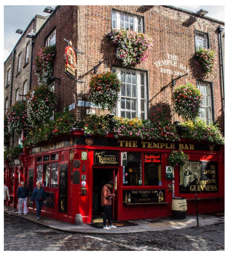
13 Days ● 20 Meals : 11 Breakfasts, 9 Dinners

HIGHLIGHTS... Dublin, Irish Evening, Guinness Storehouse Visit, Kilkenny, Waterford, Choice on Tour: Waterford Crystal Factory or Waterford Medieval Museum and Wine Vault, Blarney Castle, Boat Tour, Ring of Kerry, Cliffs of Moher, Medieval Banquet, Farm Visit, Galway, Donegal Town, Derry, Spirit of Derry Tour(compliments of VISTA), Giant's Causeway, Glens of Antrim, Belfast, "Titanic Experience"